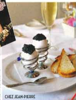
GIRONA CONSULTING CHEZ JEAN-PIERRE