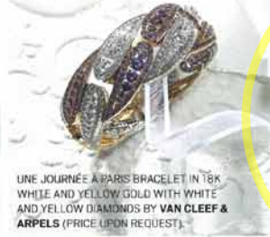
UNE JOURNÉE À PARIS BRACELET IN 18K WHITE AND YELLOW GOLD WITH WHITE AND YELLOW DIAMONDS BY VAN CLEEF & ARPELS (PRICE UPON REQUEST).