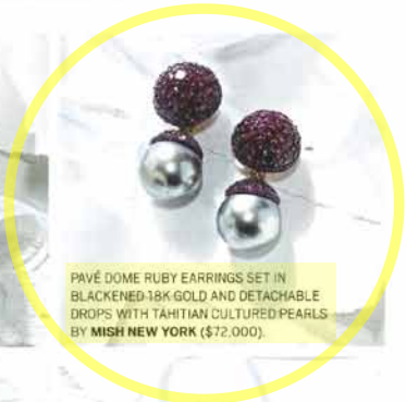
PAVÉ DOME RUBY EARRINGS SET IN BLACKENED 18K GOLD AND DETACHABLE DROPS WITH TAHITIAN CULTURED PEARLS BY MISH NEW YORK ($72,000).