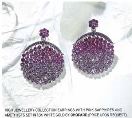
HIGH JEWELLERY COLLECTION EARRINGS WITH PINK SAPPHIRES AND AMETHYSTS SET IN 18K WHITE GOLD BY CHOPARD (PRICE UPON REQUEST).