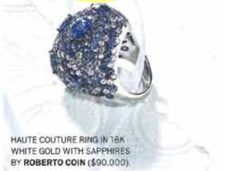
HAUTE COUTURE RING IN 18K WHITE GOLD WITH SAPPHIRES BY ROBERTO COIN ($90,000).