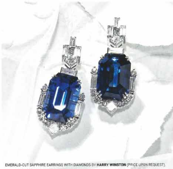
EMERALD-CUT SAPPHIRE EARRINGS WITH DIAMONDS BY HARRY WINSTON (PRICE UPON REQUEST).