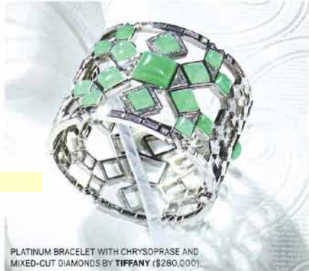
PLATINUM BRACELET WITH CHRYSOPRASE AND MIXED-CUT DIAMONDS BY TIFFANY ($280,000).