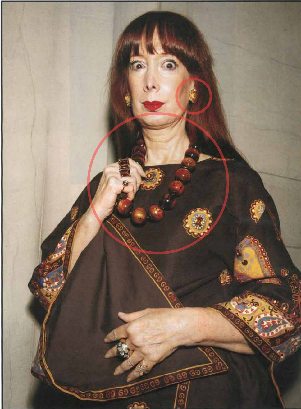
Mish New York ear clips and necklace; rings: Lisa Eisner Jewelry, Louis Vuitton (right hand, from top), from Siegelson, New York, Effy Jewelry (left hand, from top); Gucci dress.