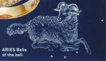
ARIES Belle of the ball.