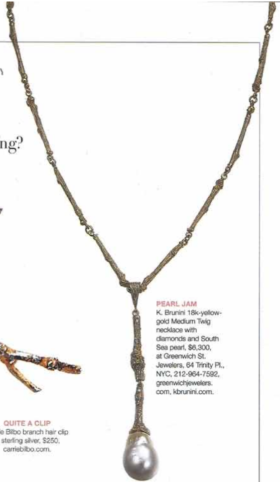
PEARL JAM K. Brunini 18k-yellow- gold Medium Twig necklace with diamonds and South Sea pearl, $8,300, at Greenwich St. Jewelers, 64 Trinity Pl., NYC, 212-964-7592, greenwichjewelers. com, kbrunini.com.