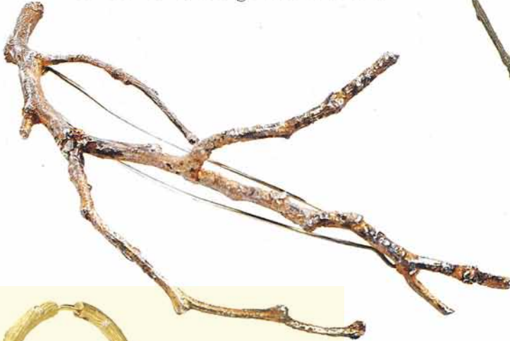
QUITE A CLIP Carrie Bilbo branch hair clip in sterling silver, $250, carriebilbo.com.

Looking for something special this spring? Don't be afraid to go out on a limb