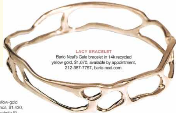
LACY BRACELET Bario Neal's Gale bracelet in 14k recycled yellow gold, $1,670, available by appointment, 212-387-7757, bario-neal.com.