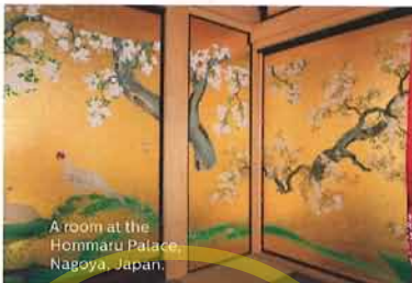
A room at the Honmaru Palace, Nagoya, Japan.