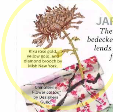
Kiku rose gold, yellow gold, and diamond brooch by Mish New York.