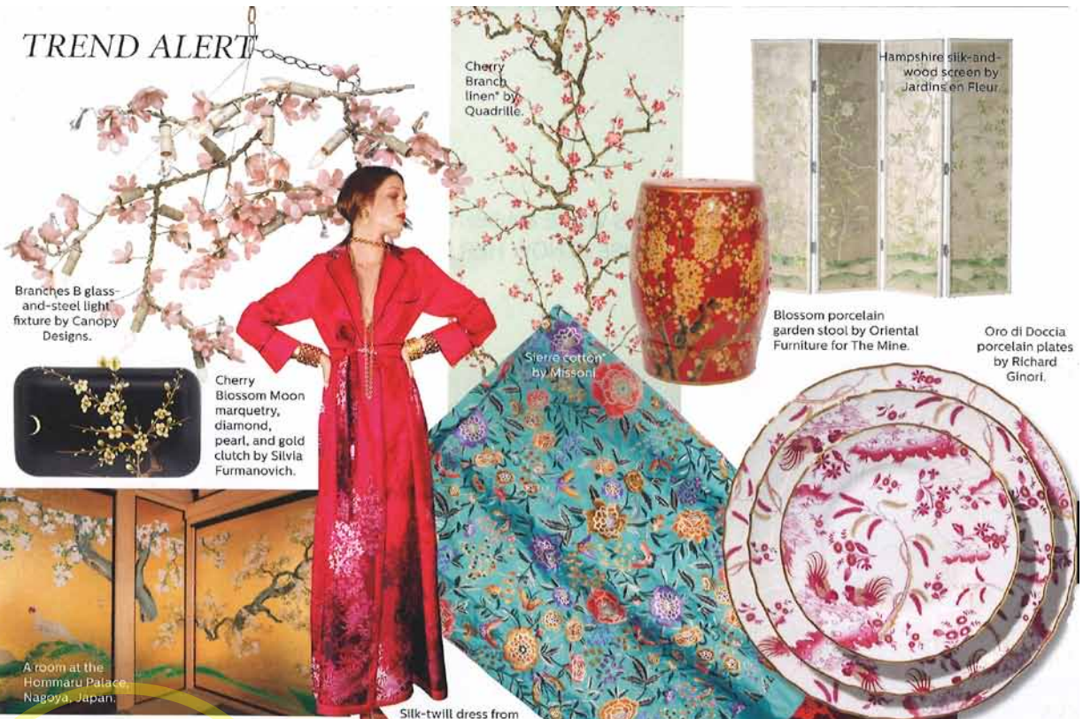
Branches B glass-and-steel light fixture by Canopy Designs.