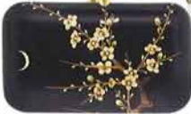
Cherry Blossom Moon marquetry, diamond, pearl, and gold clutch by Silvia Furmanovich.