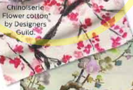
Chinoiserie Flower cotton* by Designers Guild.