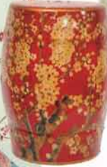
Blossom porcelain garden stool by Oriental Furniture for The Mine.