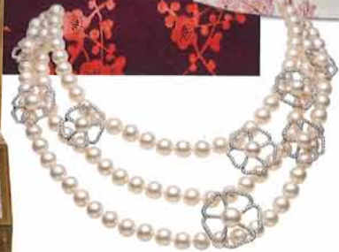
Cherry Blossom Akoya pearl, diamond, and white gold necklace by Mikimoto.