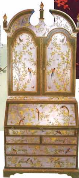
Painted silver leaf-and-wood armoire by Bradburn Home.